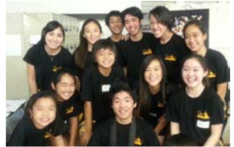
TCP's Youth Group.