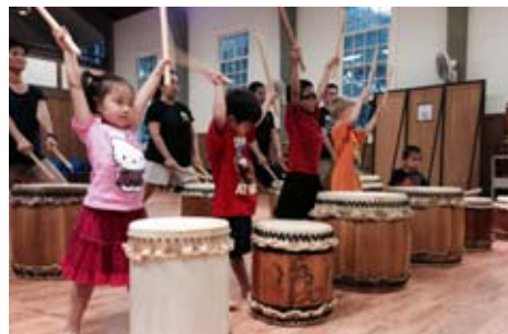
Family Taiko class.