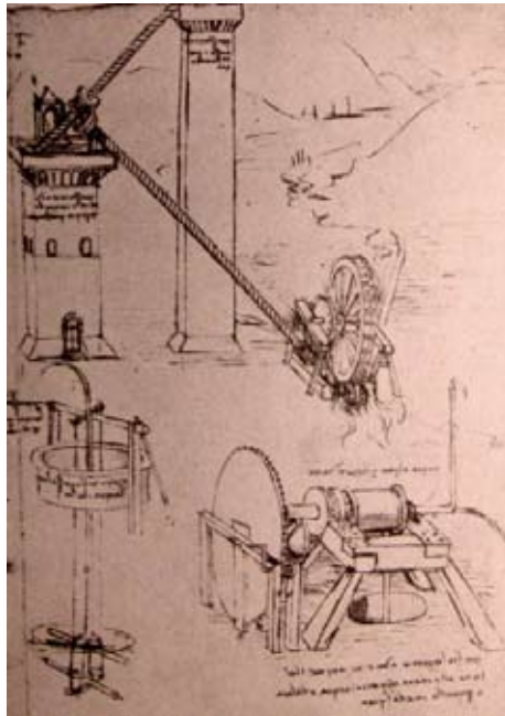
Leonardo da Vinci's diagrams in the 15th century

The new Common Core State Standards in English Language Arts, for example, anchor standard 5, ask students to "make strategic use of digital media and visual displays of data to express information and enhance understanding of presentations." Through the Inventive Engineer Posters, ideas will be expressed non-verbally and visually. Sketches, drafted details, labels, narrative description of parts and function, symbols, formulas, and correctly used standard units of measures will Bring Dreams to Life with an exciting rigor and artistry to generate interest and persuasive understanding.