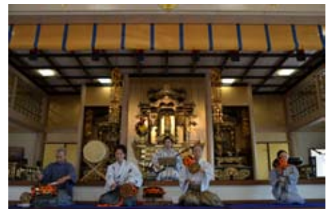
The TCP "Contemporary and Classical Japanese Drumming" project in August 2013 brought guest artists from Japan (including Kenny's hogaku teacher) for a concert performance, public presentations (this one at Palolo Hongwanji) and master classes.

In addition to the public classes, TCP periodically offers special workshops on different styles of taiko or related arts, as well as Summer Taiko Intensive week-long courses focusing on different aspects of taiko. These are led by Kenny and leading guest instructors.