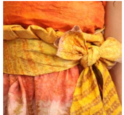
Kapa attire worn by halau dancers in their April 2011 Hilo concert performance.