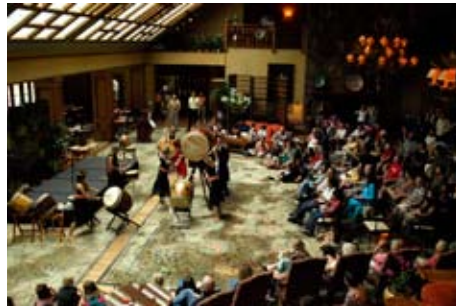
Free performance at The Lodge at Ko'e'le (2010).