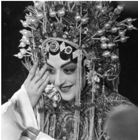
Yang Yuhuan in The Favorite Concubine Becomes Intoxicated (Guifei Zui Jiu)