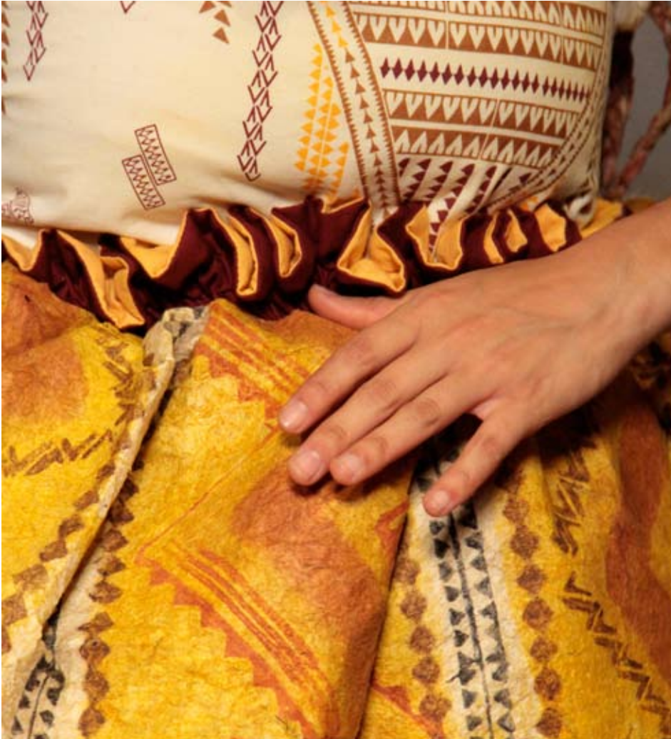
Kapa attire worn by halau dancers in their April 2011 Hilo concert performance.

K apa lovers and Hawaiian cultural practitioners are converging on Maui this month. The kapa and other exhibit items have landed at the Maui Arts & Cultural Center's Schaefer International Gallery. The gallery staff are hard at work. Halau O Kekuhi has been rehearsing on the Big Island. Publicity, including the coconut wireless, is letting friends, family and everyone who is interested in this special project, know that all are welcome to attend the 2014 activities on Maui